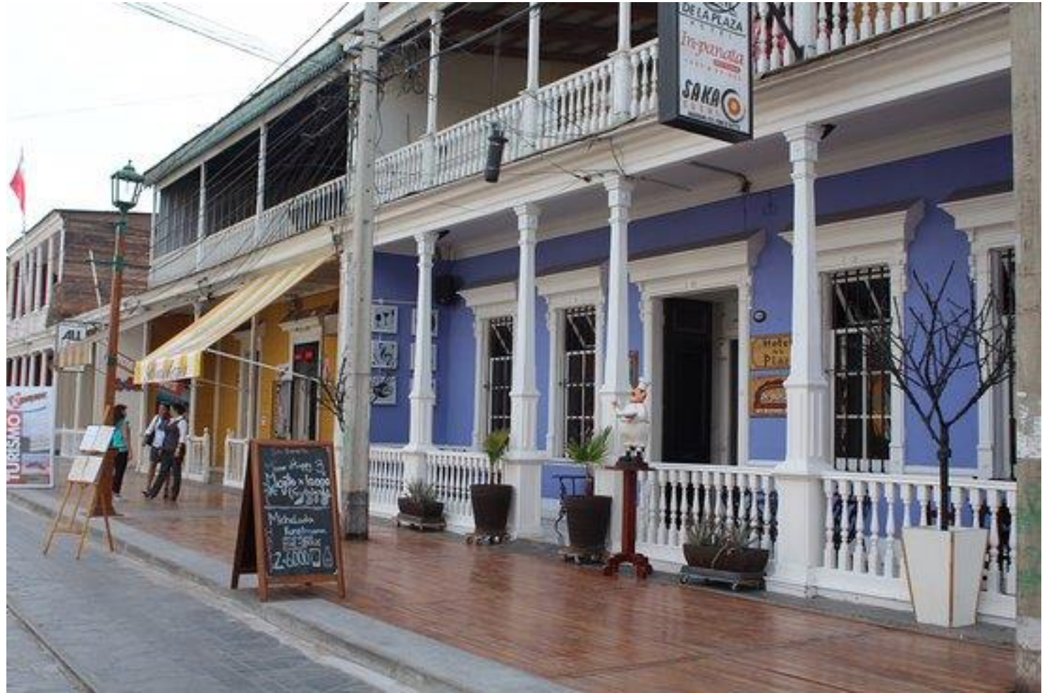
Iquique, Chile, Downtown, American Douglas Fir Architecture