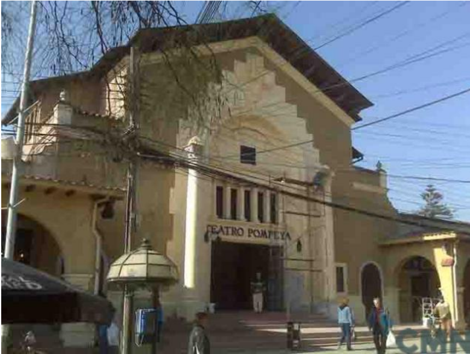
Teatro Pompeya, Villa Alemana, Chile US Douglas Fir, 1926