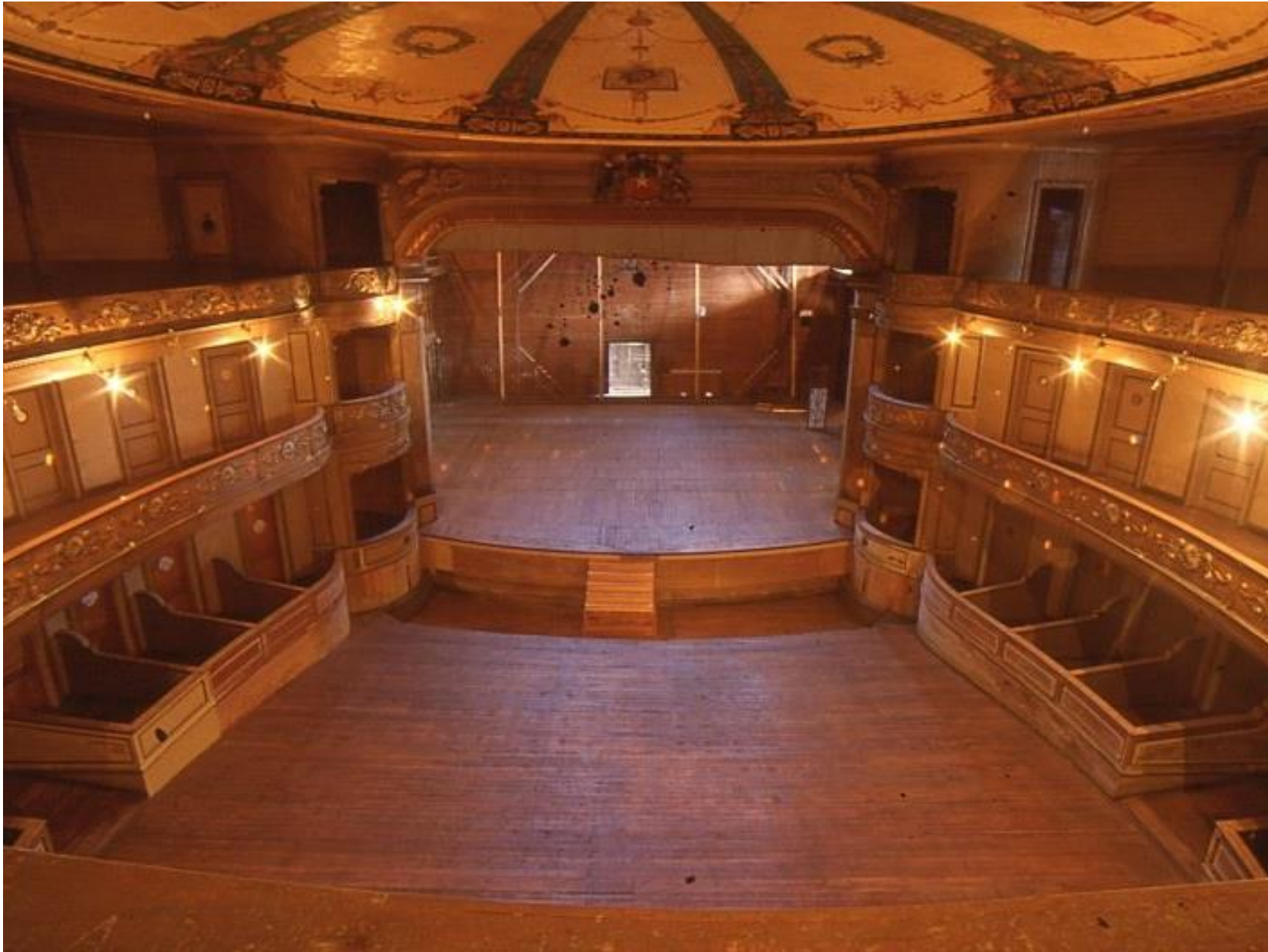
Municipal Theater, Iquique, Chile US Douglas Fir, 1890