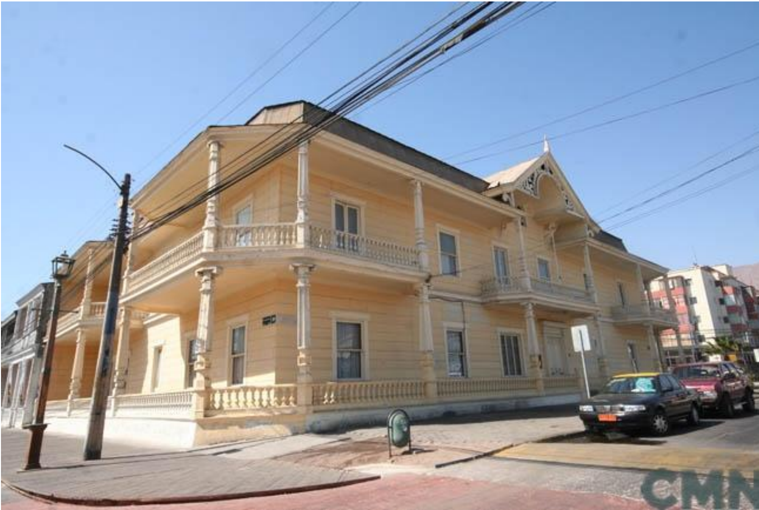
Astoreca Palace, US Douglas Fir, XIX Century, Platform Frame, Iquique, Chile