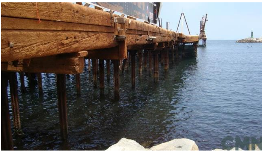
Melbourne Clark Pier, US Douglas Fir, Antofagasta, 1872