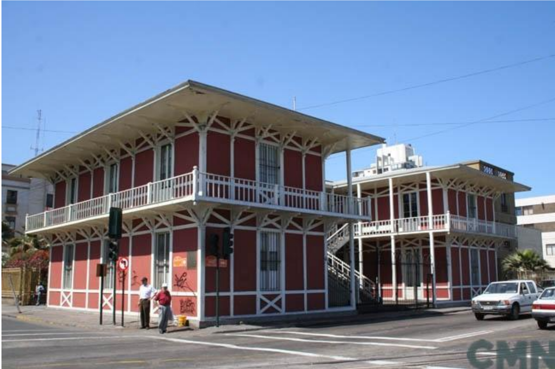
Former Customs Building, Currently City Hall Museum US Douglas Fir Antofagasta, Chile, 1871