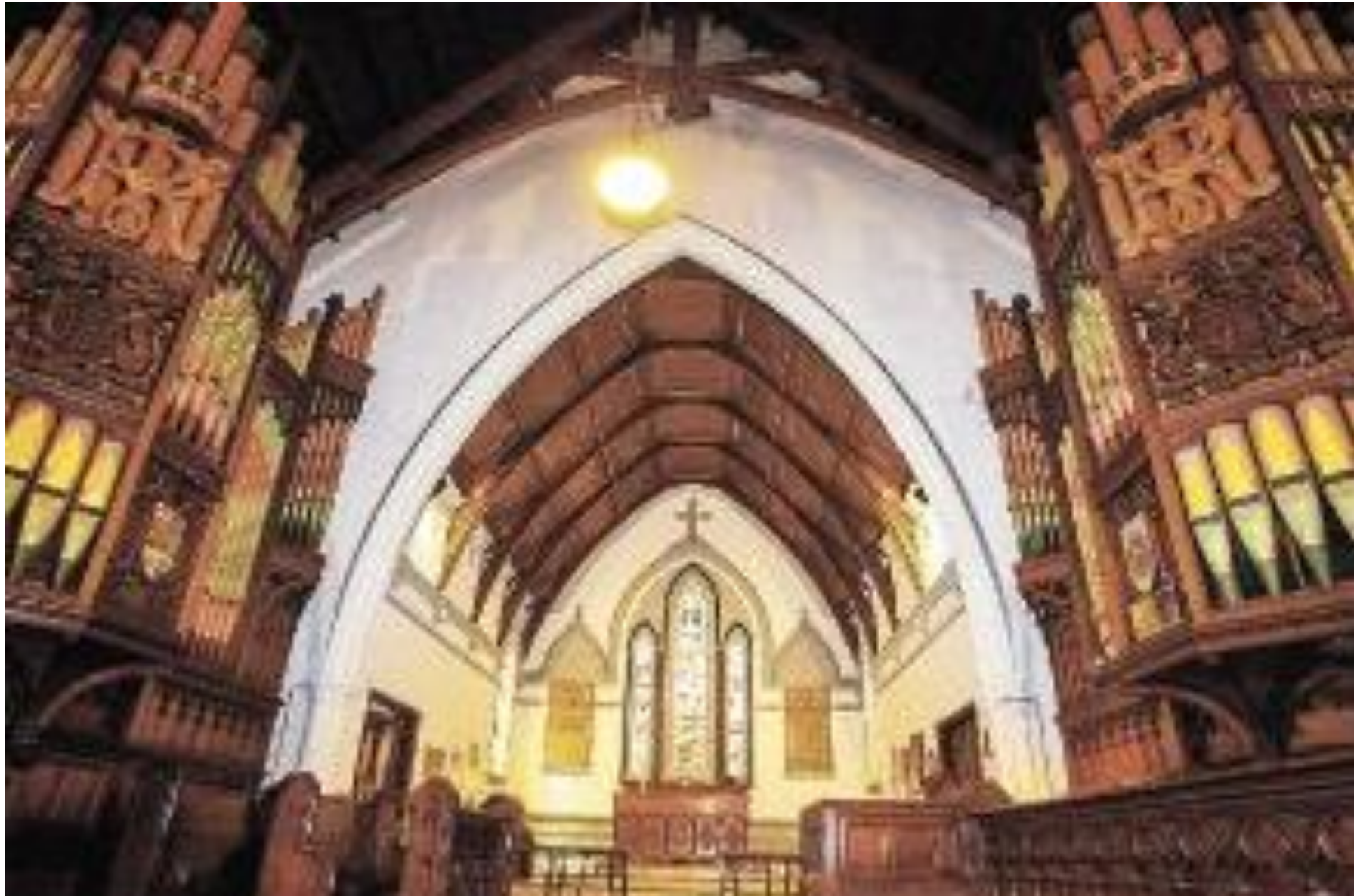
Anglican Church, Valparaiso US Douglas Fir, 1858