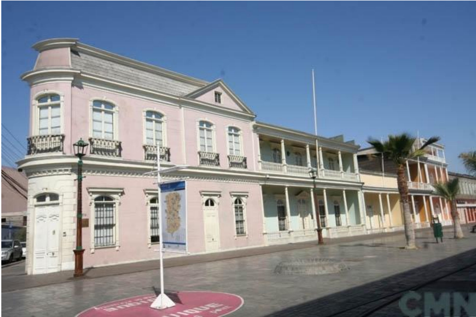
Baquedano Pedestrian Street, Iquique, XIX Century, US Douglas Fir