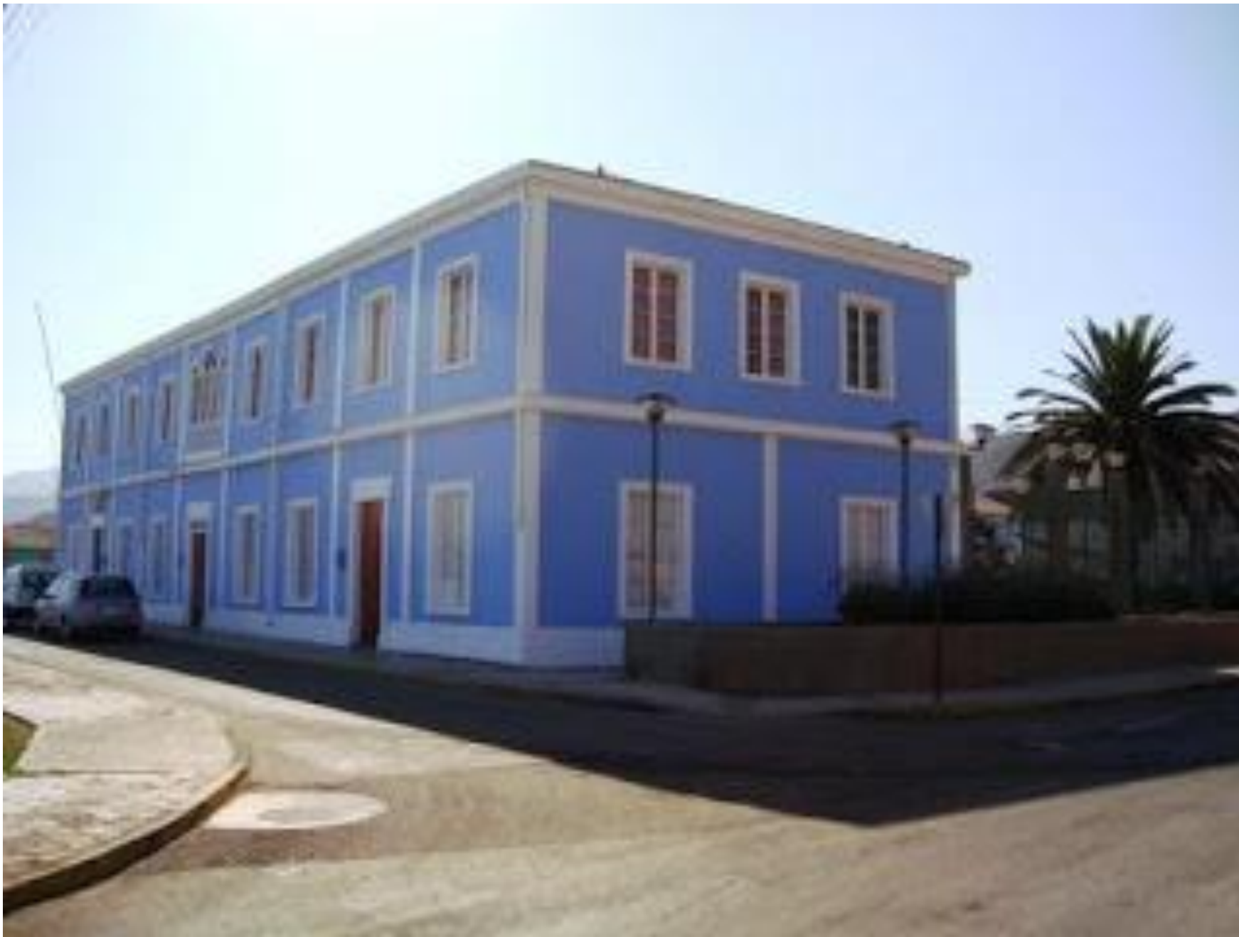
Museo Capdeville, Taltal, 1885 American Douglas Fir More than 130 years !