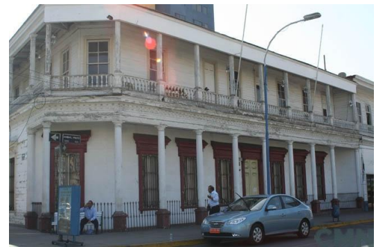
Corporate Building "The Nitrate Agencies Limited" Iquique, XIX Century, US Douglas Fir