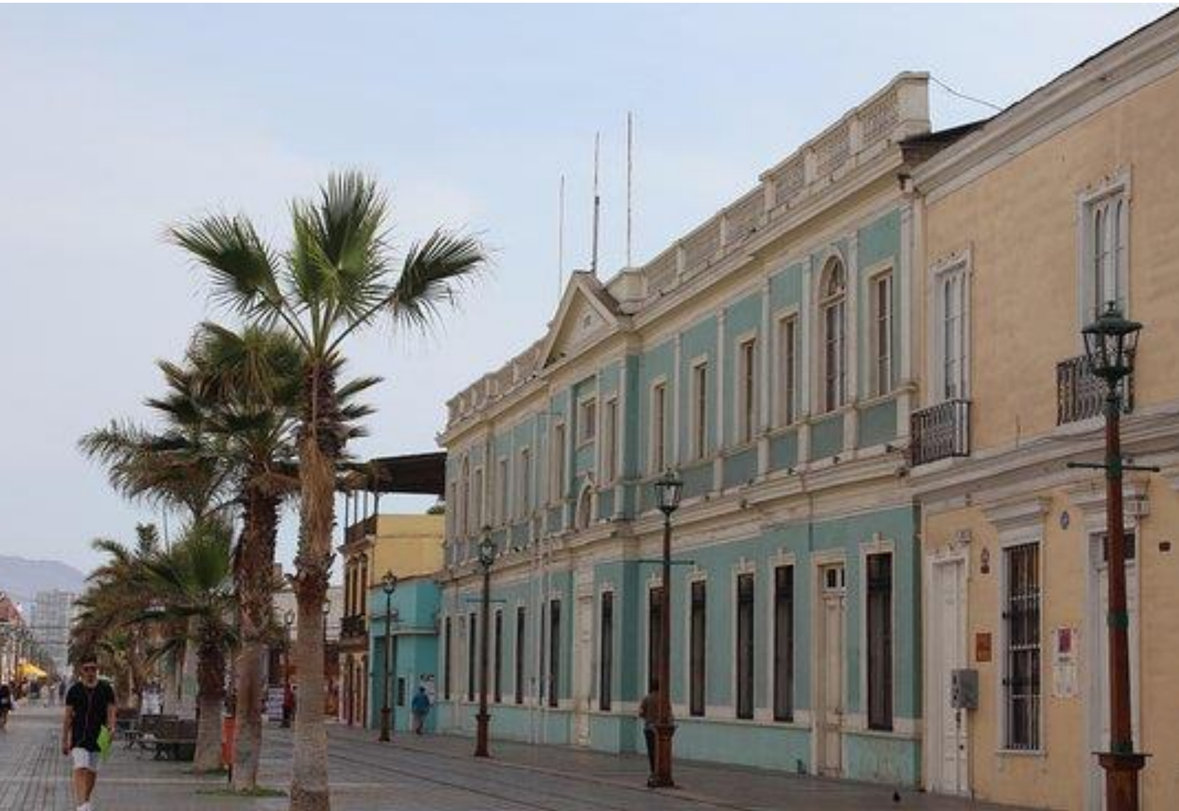
Baquedano Pedestrian Street, Iquique, XIX Century US Douglas Fir