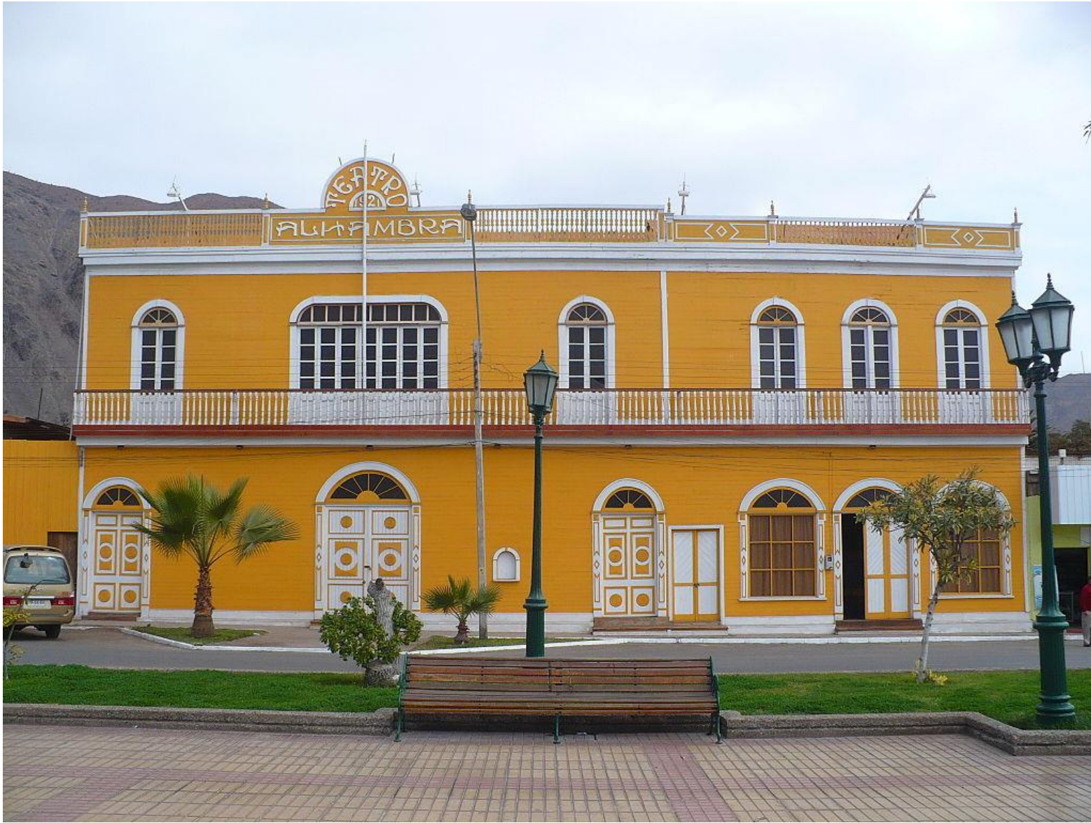
La Alhambra Theater , Taltal, Chile American Douglas Fir, 1921