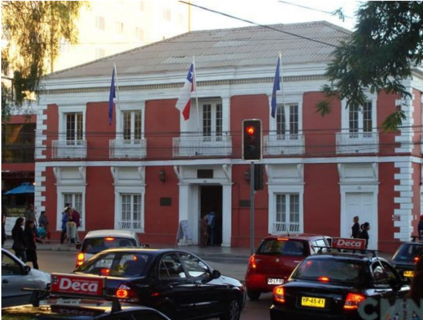
City Hall Building , Copiapó, Chile US Douglas Fir, 1860