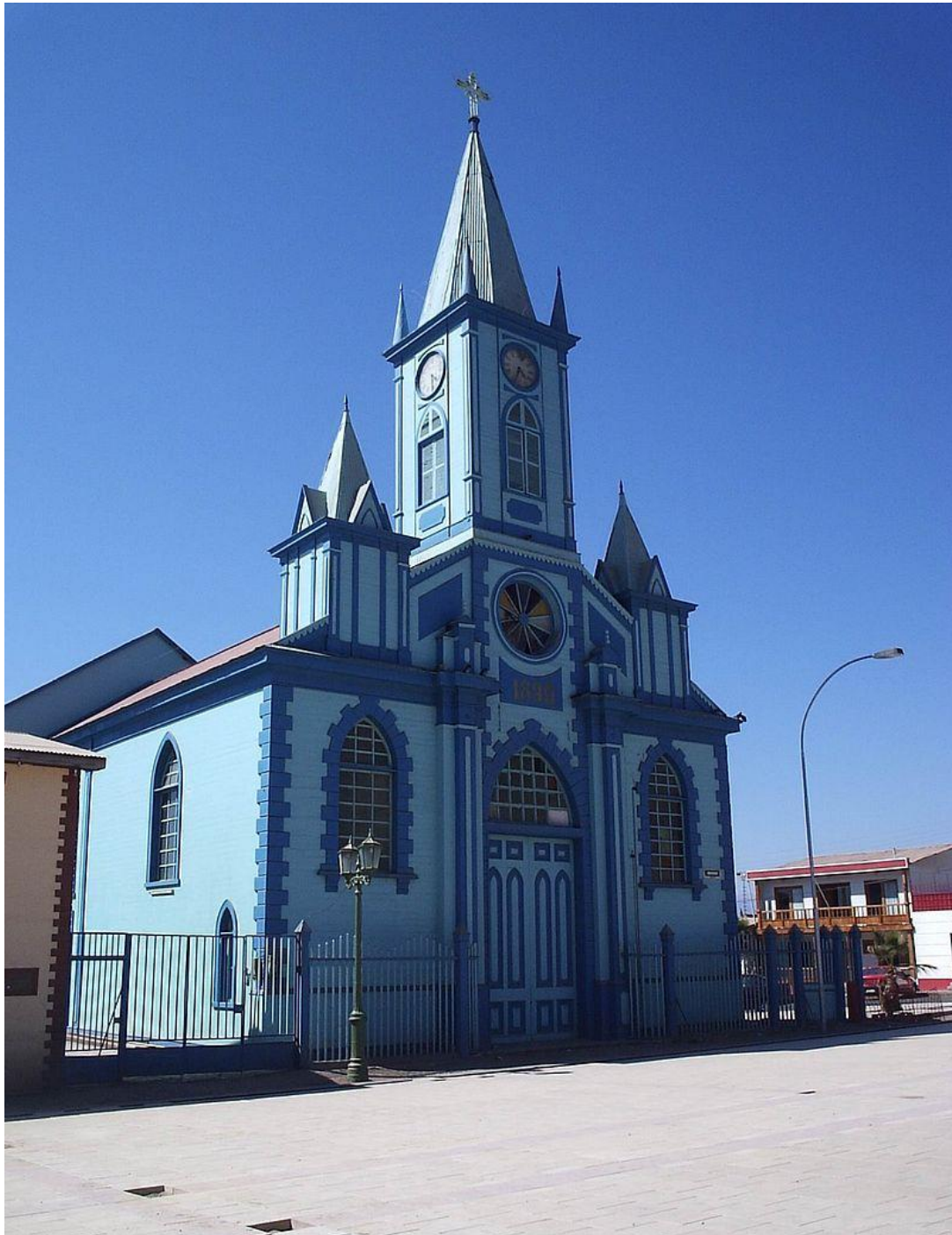
Iglesia de San Francisco Javier, Taltal, Chile American Douglas Fir, 1860