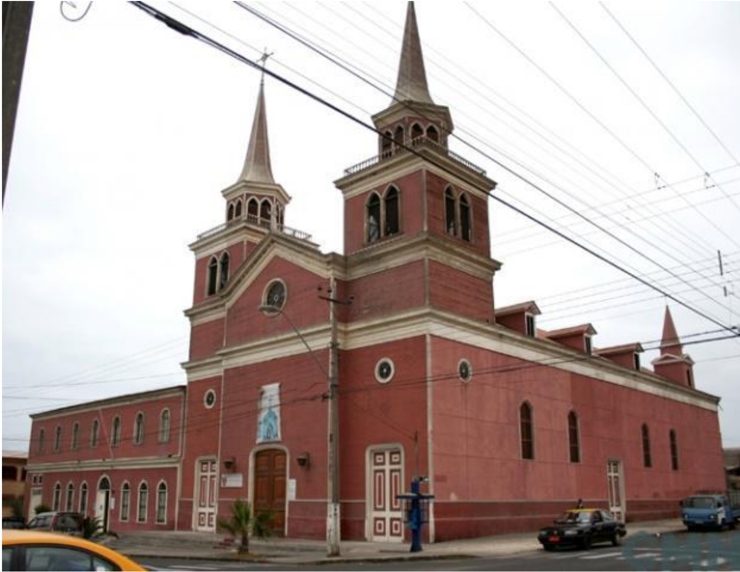
San Antonio de Padua Church and Franciscan Convent, Iquique Chile US Douglas Fir, XIX Century