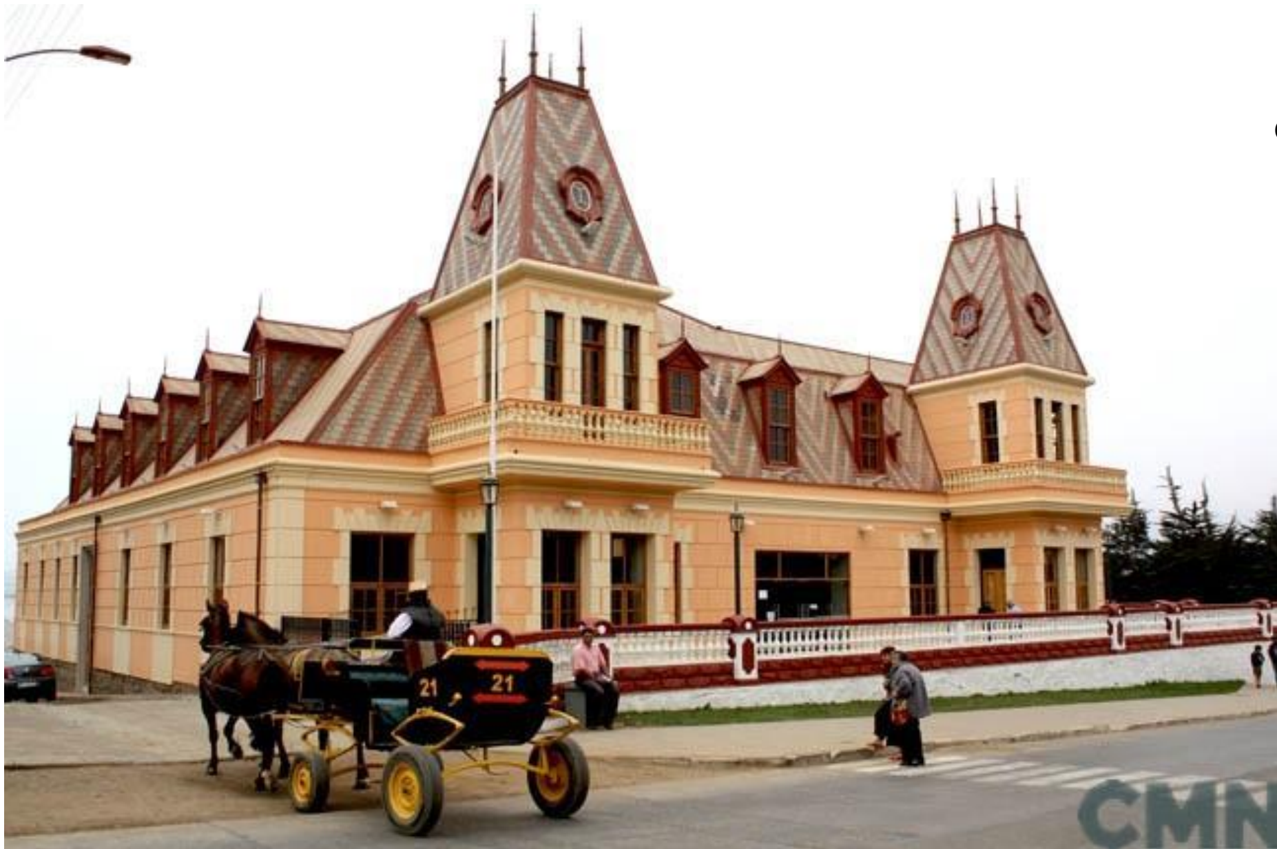
Pichilemu Casino and Ross Gardens, Chile, Douglas Fir, 1906